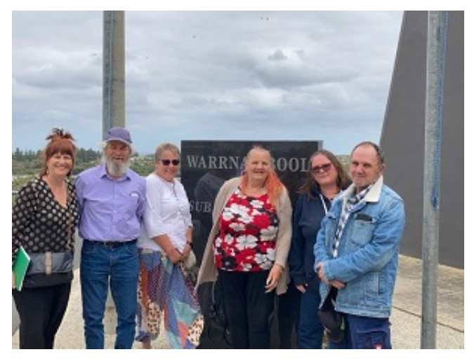
South West SSG

Recently in August we returned to The Archie Graham Centre for the first time since before COVID-19. The centre has had a refurbishment and we can now enjoy a much brighter room with kitchen facilities. We enjoyed our lunch that was catered by the Tasty Plate and unfortunately, we forgot to take photos!